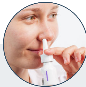
LEFT HAND, right nostril

Use OTHER MEDICATION sent to you by compound pharmacy as instructed.