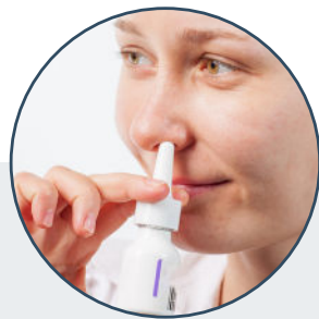
RIGHT HAND, left nostril

Use opposite hands to spray your nose; follow images below.